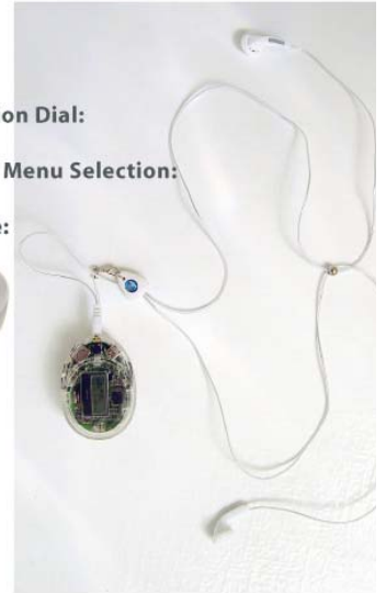
Includes: Combination neck strap and headphones